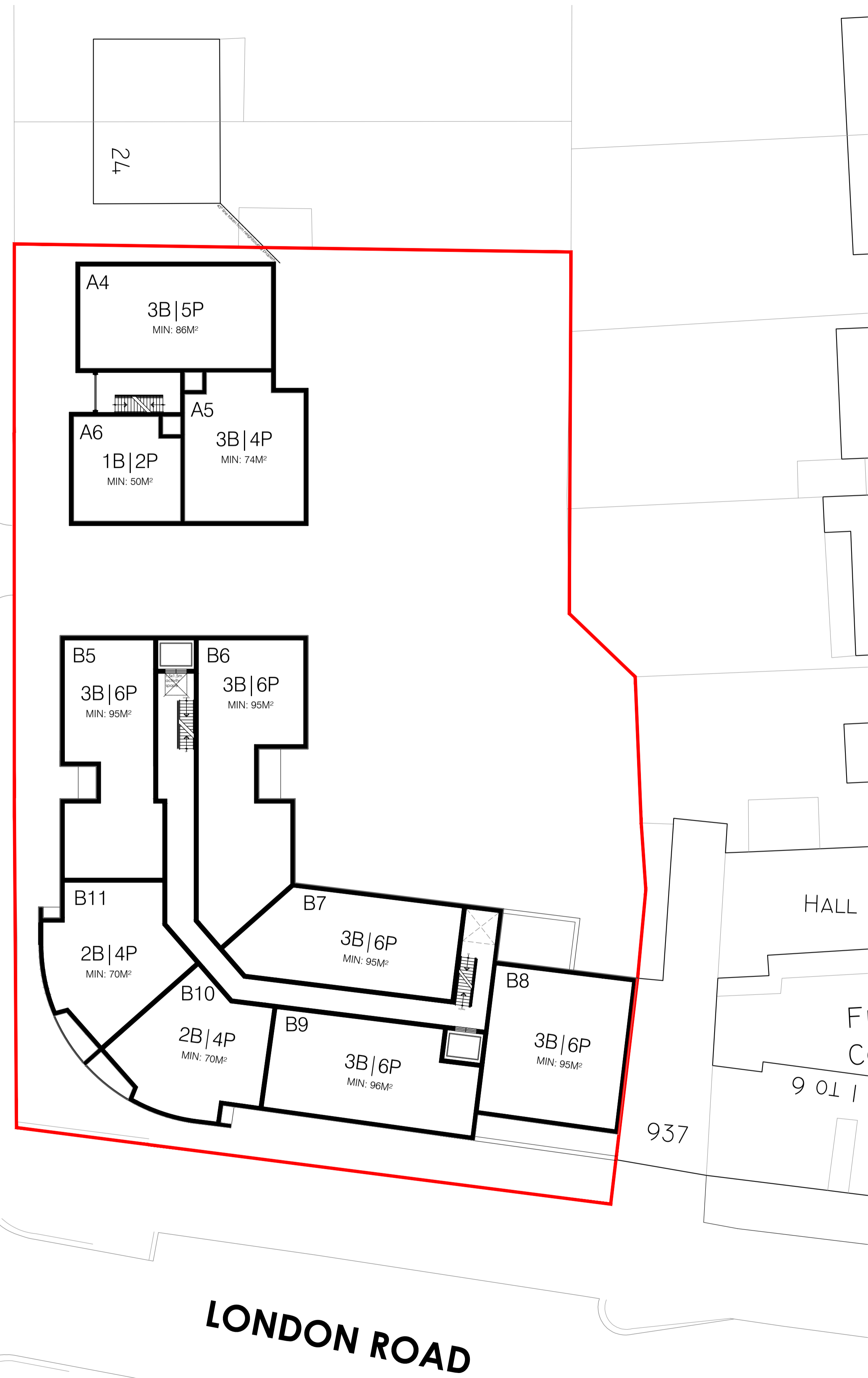
PROPOSED FIRST FLOOR BLOCK PLAN SCALE: 1:200@A1