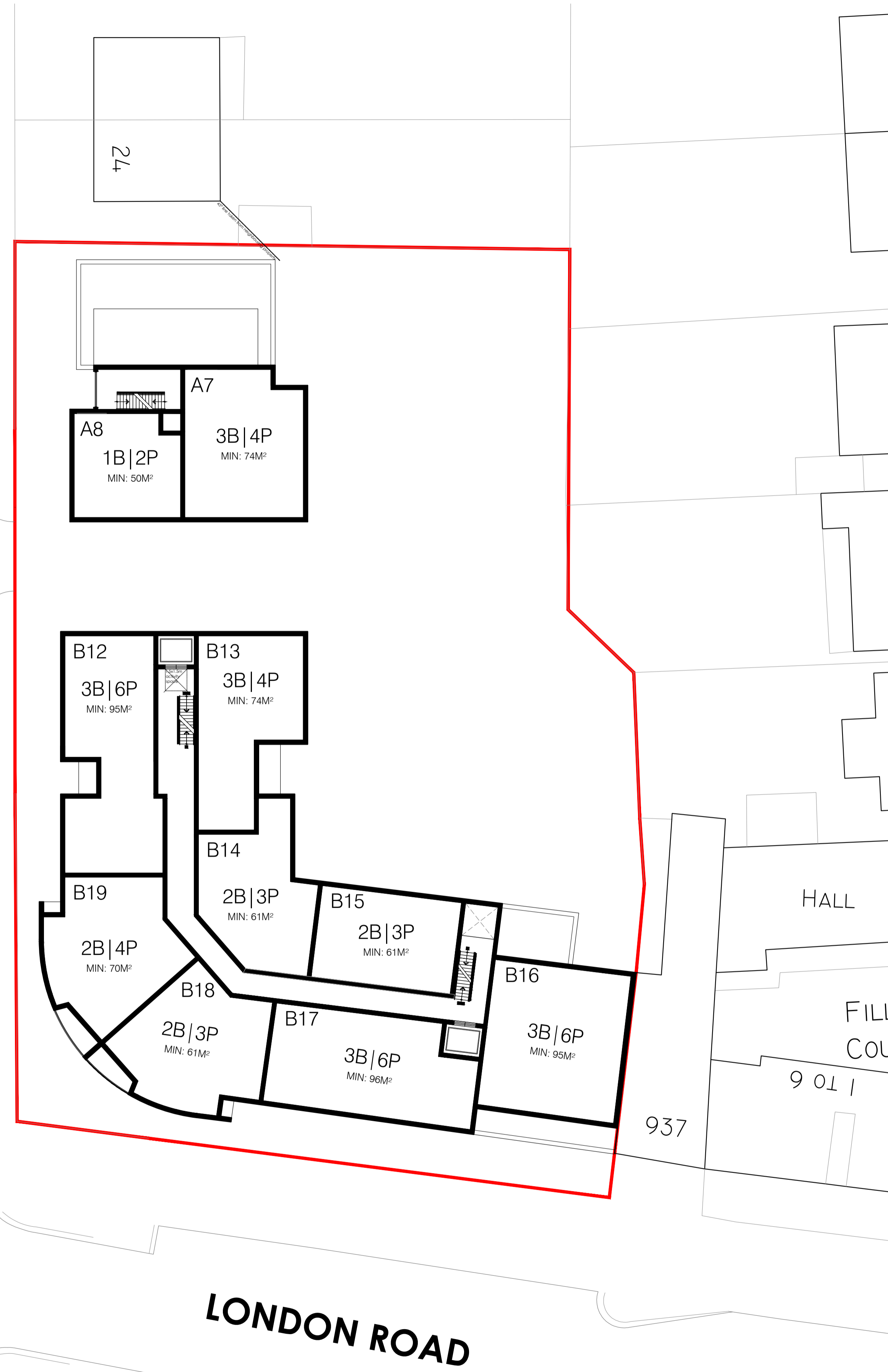
PROPOSED SECOND FLOOR BLOCK PLAN SCALE: 1:200@A1